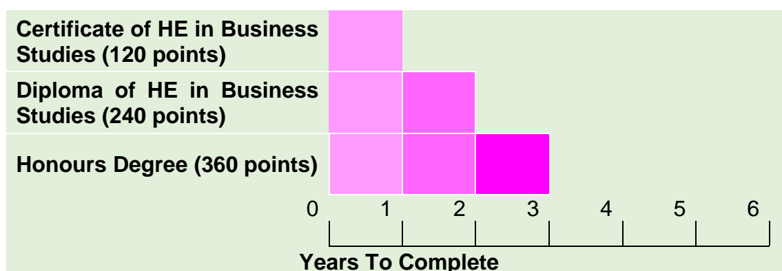
Figure 8.1. Types of Awards Offered by AOU and the Open University, UK.

Please note that the Certificate and Diploma awards are exit awards only.